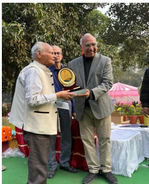
PUNE WINTER ROSE SHOW