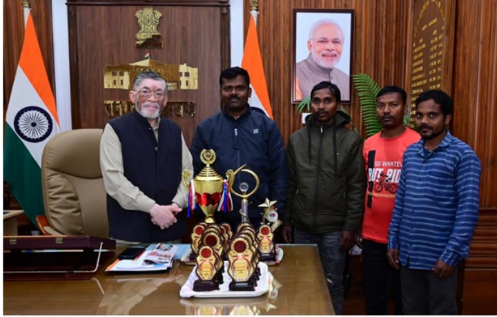
Hon'ble Governor, Jharkhand appreciating the Raj Bhawan Team