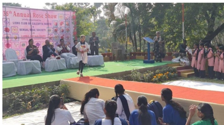
Ramp Show by School Children